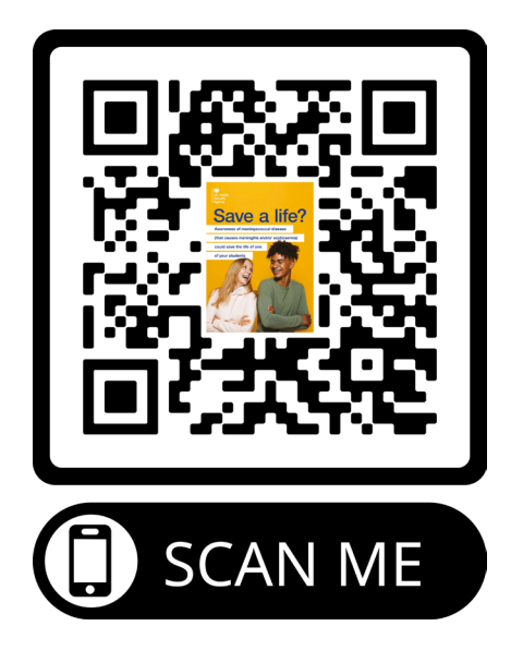
Table 1. Campaign resources

MMR, MenACWY and COVID-19 vaccine comms toolkit for universities and further education settings