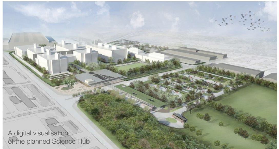
A digital visualisation of the planned Science Hub