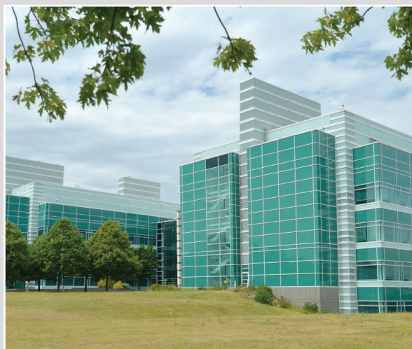
PHE Harlow site

Harlow MP Robert Halfon described the relocation plans as "the most exciting thing to happen to Harlow in a generation", bringing an initial 2,750 jobs and £400m worth of investment to the town.