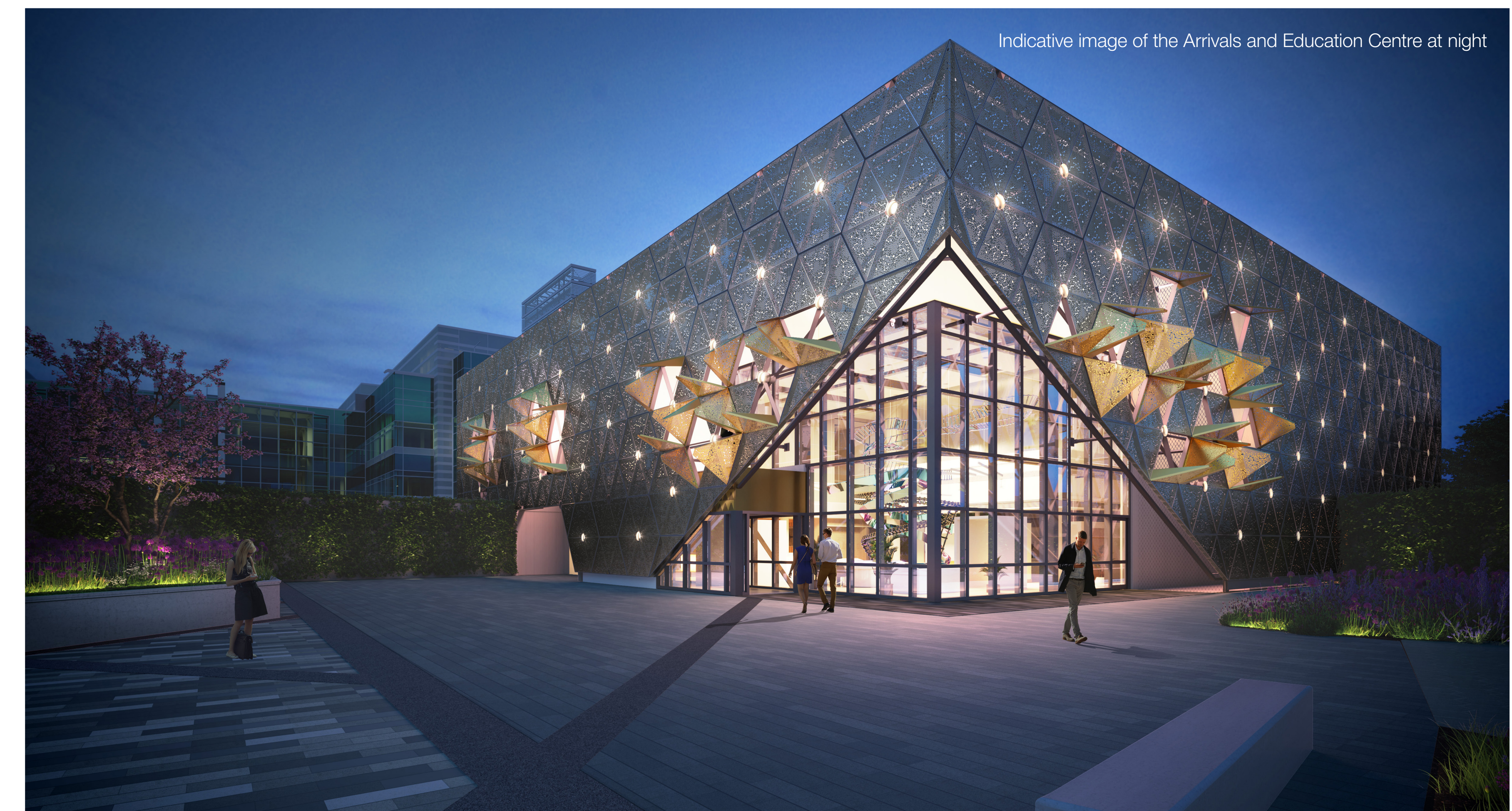
Indicative image of the Arrivals and Education Centre at night