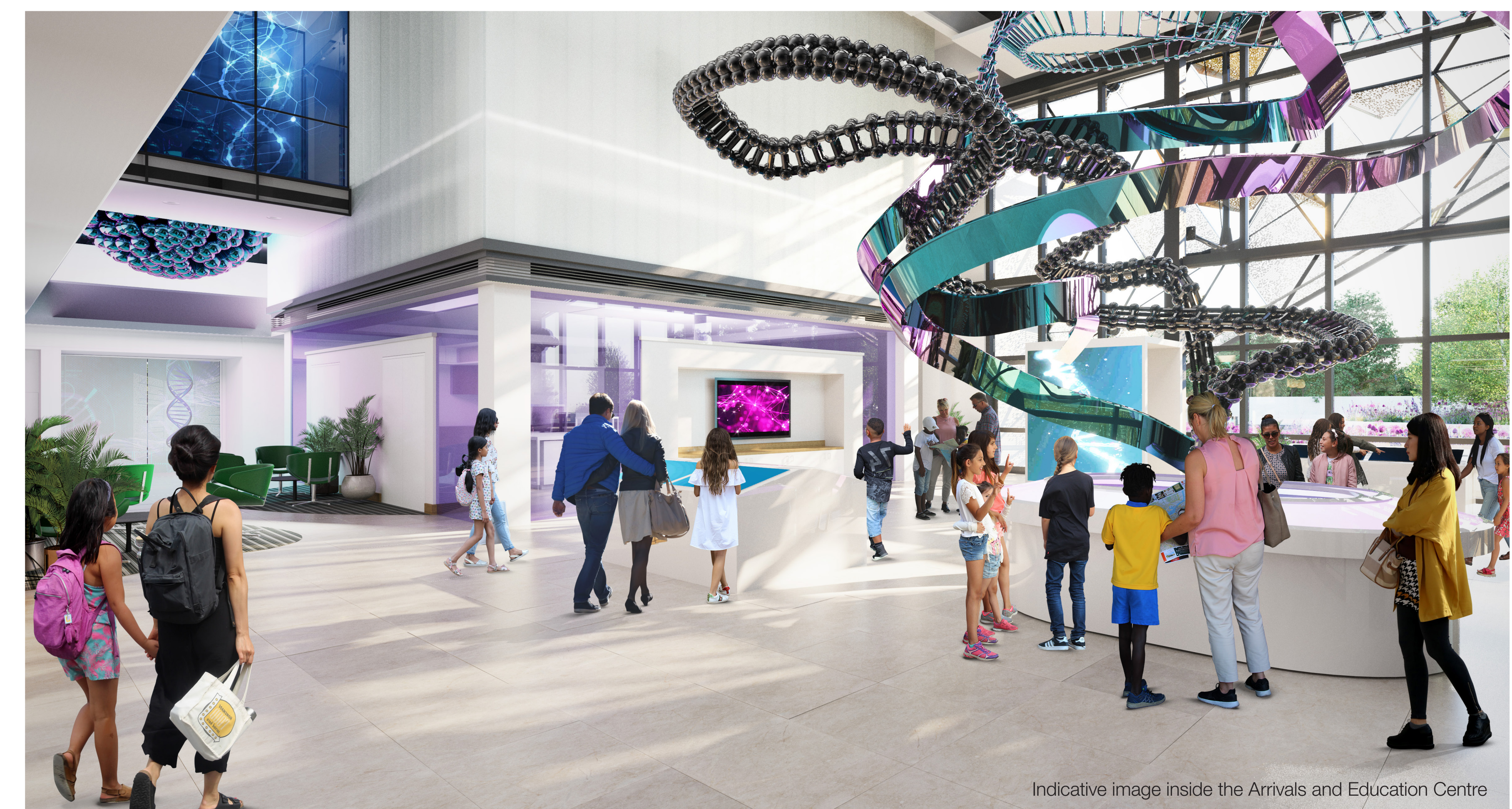
Indicative image inside the Arrivals and Education Centre