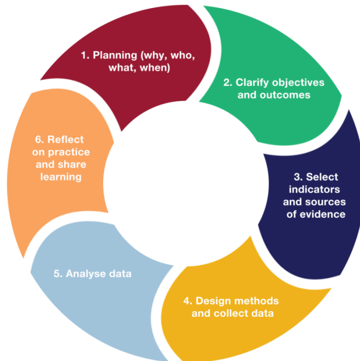
Figure 2: project development cycle

This section will outline a step-by-step guide to planning, designing and conducting an evaluation. The process is based on the project development cycle developed as a tool to facilitate project planning.