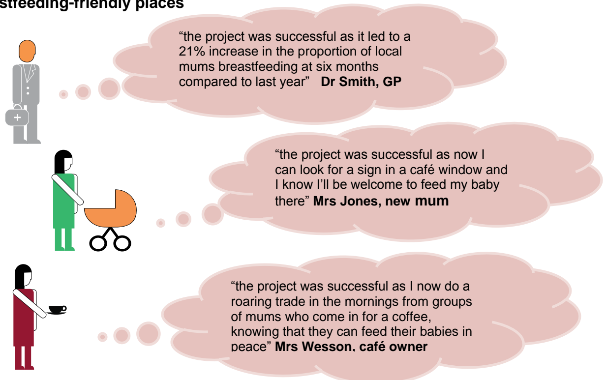
Figure 1: differing perspectives on the impact of a project to promote breastfeeding-friendly places

When planning an evaluation it is critical to think carefully about the target audience for the evaluation. Who are you conducting the evaluation for? What do they need to know? What will they do as a result? What sort of information do they need? Figure 1 illustrates three different perspectives on the impact of a project to promote breastfeeding-friendly public places.