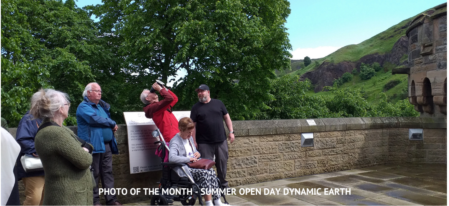
PHOTO OF THE MONTH - SUMMER OPEN DAY DYNAMIC EARTH